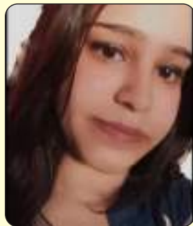
Smily Bachelor of Computer Application Sem-III