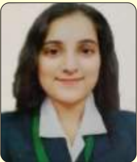
Roohani B.Voc(Mental Health & Counselling) Sem-V